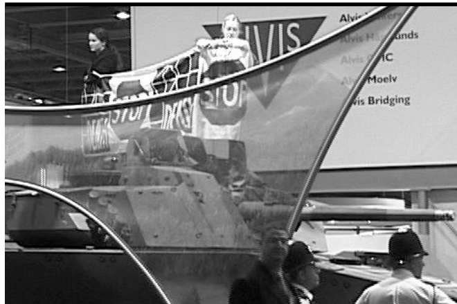
Demonstrators occupy a tank at the DSEi arms fair

Such massive support forced the managers to the negotiating table where they capitulated completely. Not only have the sacked contractors won equal pay but also compensation payments and an extension of the agreement to a third yard in the area.