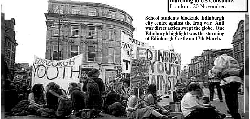
School students blockade Edinburgh city centre against the Iraq war. Anti war direct action swept the globe. One Edinburgh highlight was the storming of Edinburgh Castle on 17th March.

STOP BUSH DEMOS Edinburgh : 19 Nov. 2pm Bristo Sq. and 6pm Charlotte Sq., marching to US Consulate. London : 20 November.